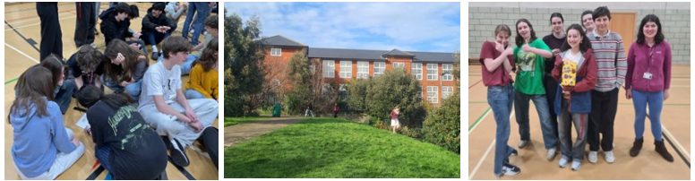
Table Talk: topics and questions from Religious Studies